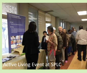
Active Living Event at SPLC