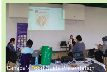
Canada's Food Guide Presentation