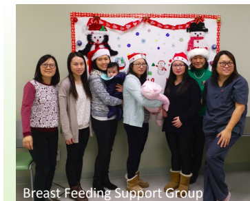
Breast Feeding Support Group