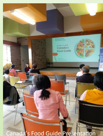
Canada's Food Guide Presentation