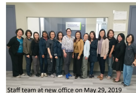
Staff team at new office on May 29, 2019

New address for HFCHNPLC beginning May 29, 2019