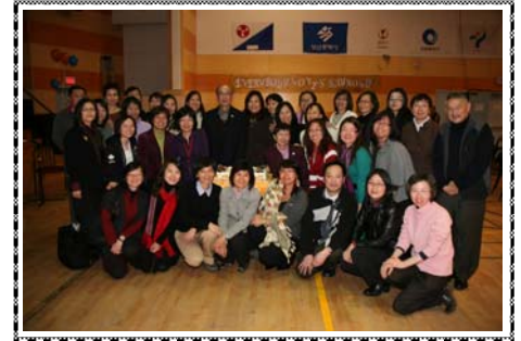
Hong Fook family with staff from present and past