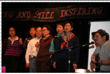
Performance by Self Help Program participants