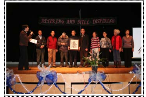
Gift presented by the Seniors Holistic Health Group