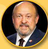
Opening Remarks by Hon. Michael Tibollo, Associate Minister of Mental Health and Addictions

Please visit www.hongfook.ca/foundation to find more details. For inquiries, please call 416-493-4242 ext. 5283 or email to foundation@hongfook.ca . Raffle tickets can be purchased at all four Hong Fook locations.