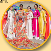
Ao Dai Fashion Show by Ao Dai Canada