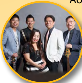
... and CarryOn Band