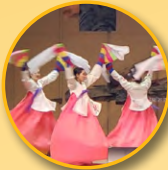
Jang Go Chum Dance by Navillera Korean Performing Arts Development