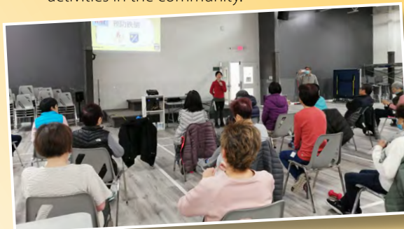
A presentation on Fall Prevention was delivered to the Grace Community Services Seniors Club in person

Last but not least, this year the NPLC has achieved its 10th anniversary. Stay tuned for our open house and many more celebration activities in the community.